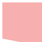
Coral Rose (1)