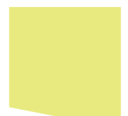
Golden Light (8)