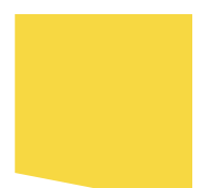
Sahara Sun (4)