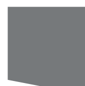
Evening Shadow (7)