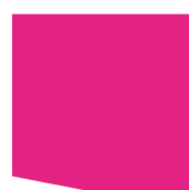
Ruby Red (5)