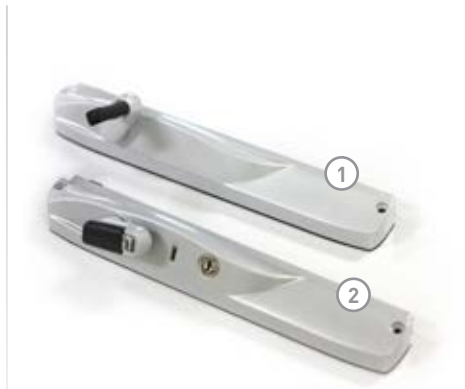
Chainwinder - Silver

1. Non-keyed chainwinder shown on top row 2. Keyed chainwinder shown on bottom row