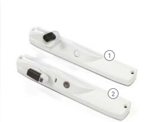
Chainwinder - White