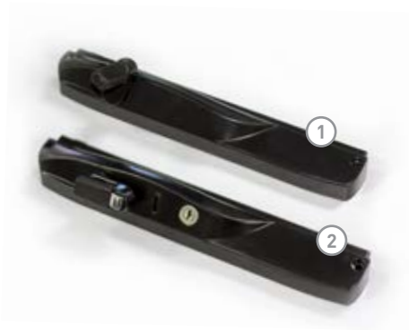
Chainwinder - Black

Black, non-keyed chainwinder supplied as standard. All other options are to be specified at time of quotation / order (additional costs apply).