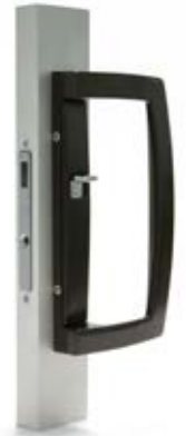
Axiom 'D' Pull Mortice Lock