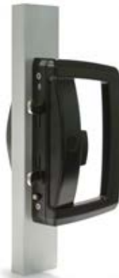
Onyx 'D' Pull Standard