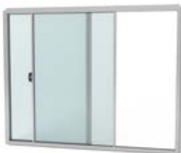
Window Wall 1