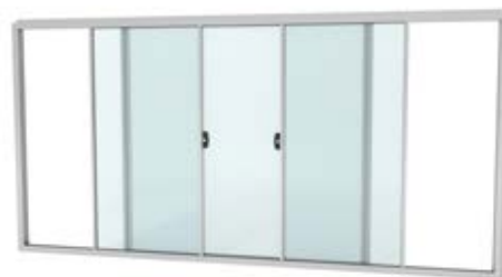
Fixed / Slider / Slider / Fixed Window 1